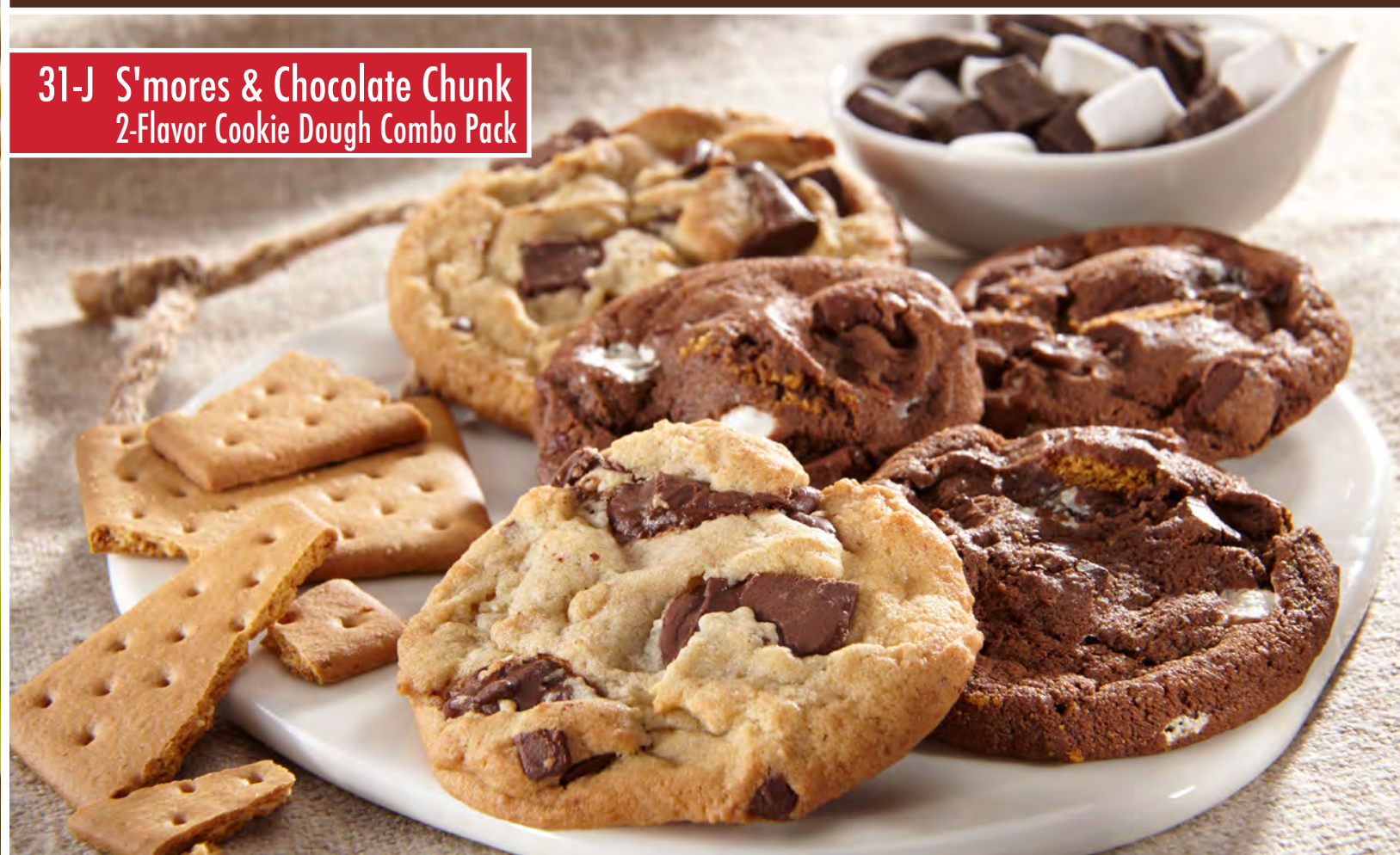
31-J S'mores & Chocolate Chunk 2-Flavor Cookie Dough Combo Pack