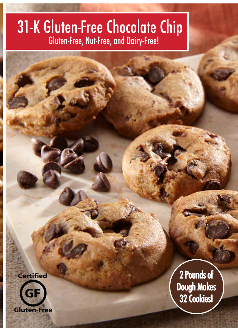
31-K Gluten-Free Chocolate Chip Gluten-Free, Nut-Free, and Dairy-Free!