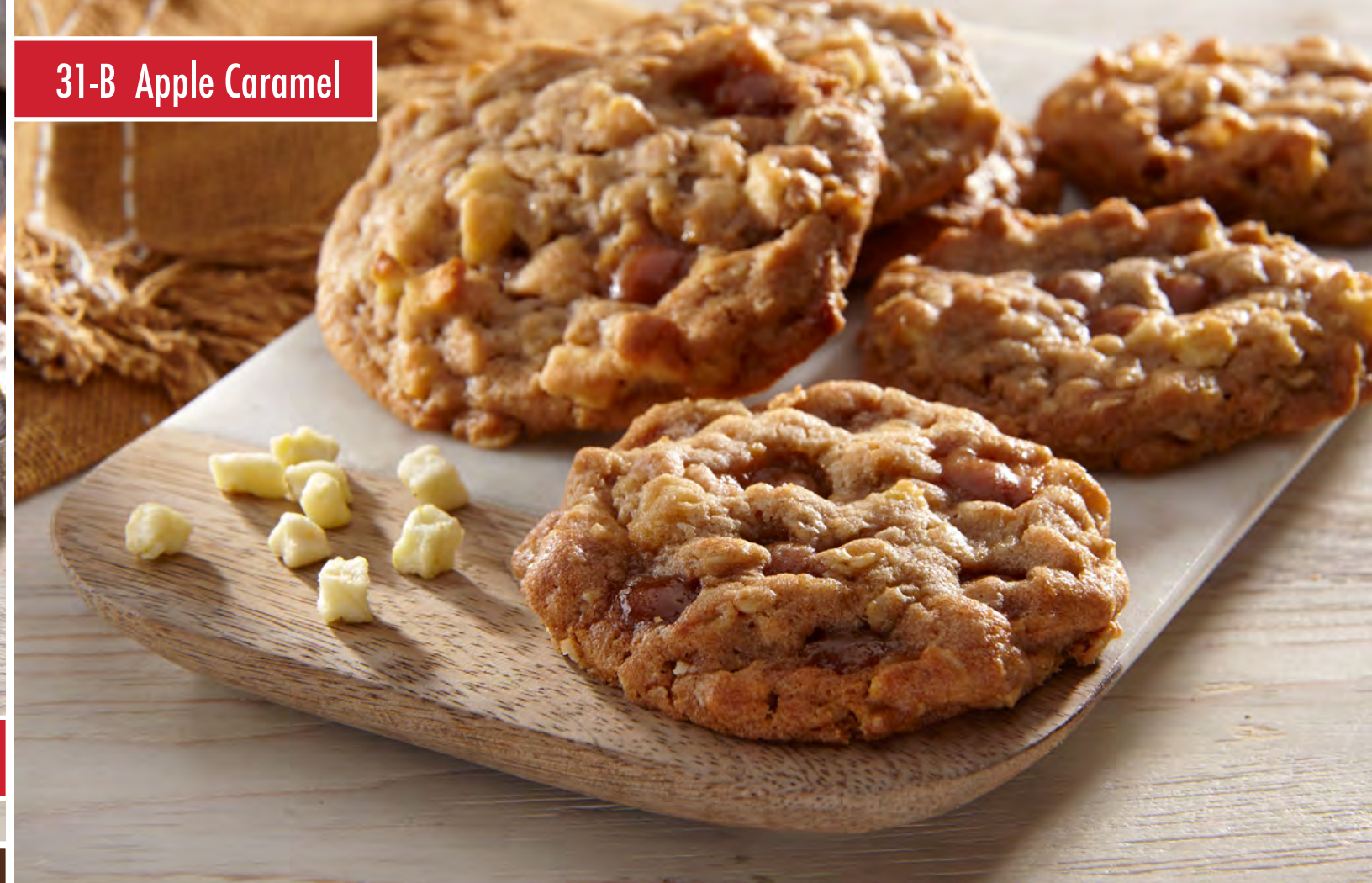
31-B Apple Caramel