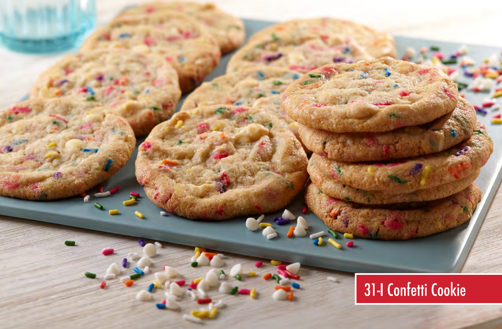
31-I Confetti Cookie