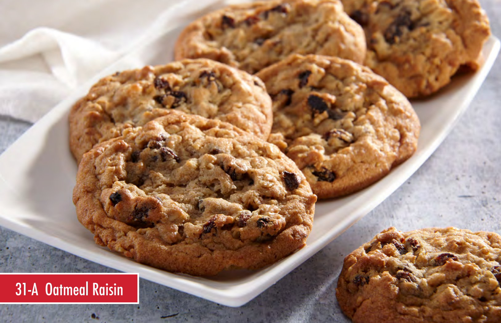
31-A Oatmeal Raisin