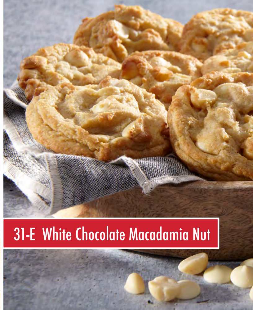
31-E White Chocolate Macadamia Nut