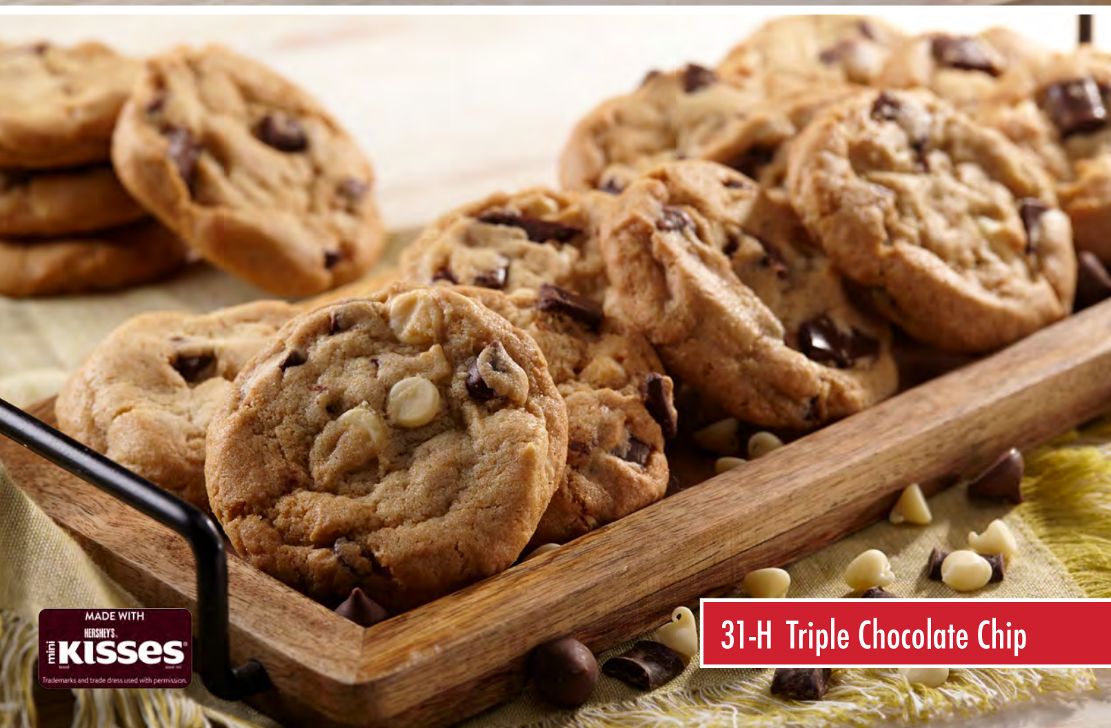
31-H Triple Chocolate Chip