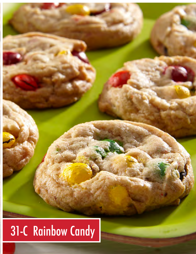
31-C Rainbow Candy