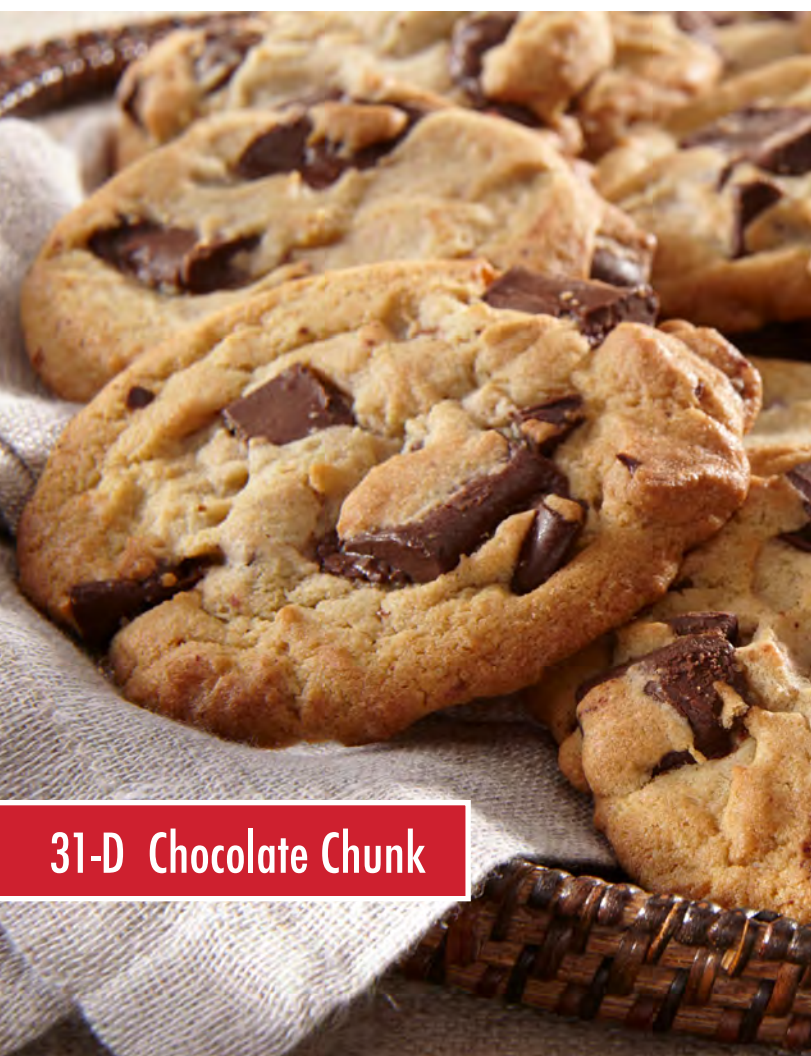
31-D Chocolate Chunk