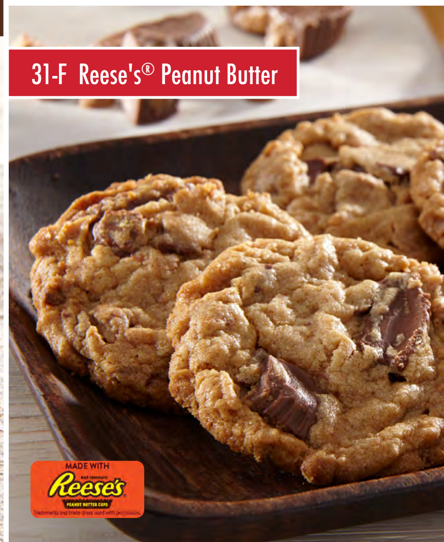
31-F Reese's® Peanut Butter